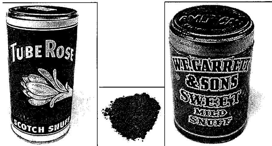
Figure 1 Powdered dry snuff.

Dry snuff is made from fermented, fire-cured tobacco that is pulverized into powder. Nasal inhalation of dry snuff was widely practiced in Europe in the 17 th and 18 th centuries but declined thereafter [37]. Manufacturers in Germany and the U.K. still provide an array of flavored dry snuff products for a small number of contemporary users in those countries. In the U.S. powdered dry snuff, also called dental or Scotch snuff, is sold in small canisters. Since the early 1800s it has been used primarily by women in Southern states [29,38], who place the powder on the gum or between the gum and cheek. However, use of dry snuff is declining, and sales have fallen 67% in the past 15 years [39].