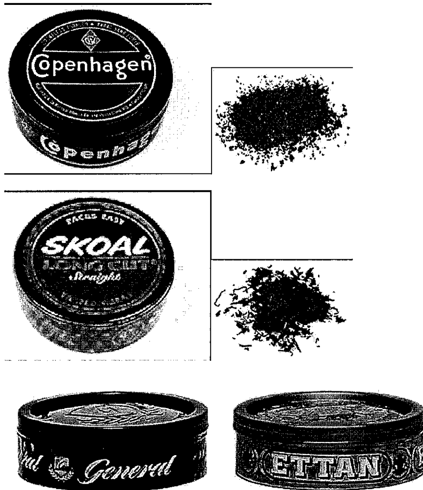
Figure 3 Moist snuff.

been documented by the National Health Interview Survey (NHIS). For adults, NHIS defines current ST users as those individuals who have used ST at least 20 times in their lives and are using ST every day or some days. In 1991 the prevalence of current ST use among adult men in the U.S. was about 5.6% (4.8 million), which declined to 4.4% (4.4 million) in 2000. In 1991 about 0.6% (533,000) of adult women in the U.S. were current users, and prevalence declined to 0.3% (324,000) by 2000 [42,43].